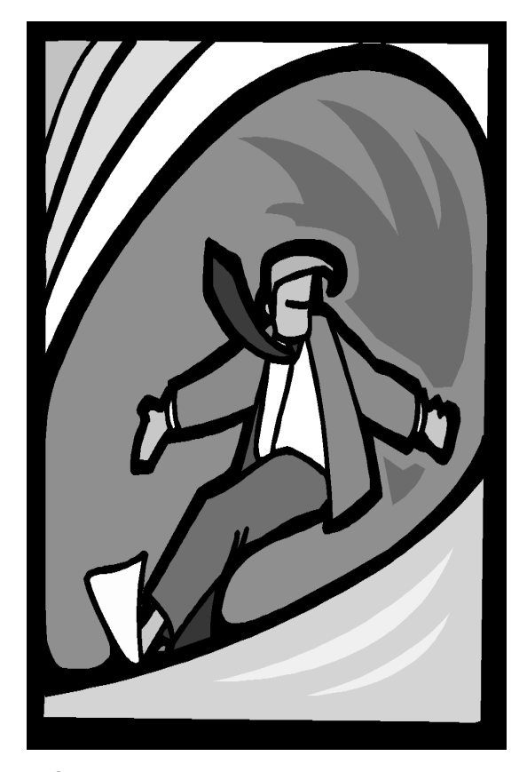
SURF OUR WEBSITE AT WWW.TCMC.ORG